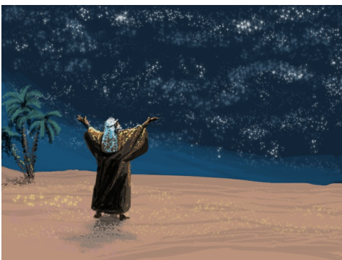
Abraham believed God (Gal 3:6+, Ge 15:5,6+)

Genesis 18:1 Now the LORD appeared to him by the oaks of Mamre, while he was sitting at the tent door in the heat of the day.